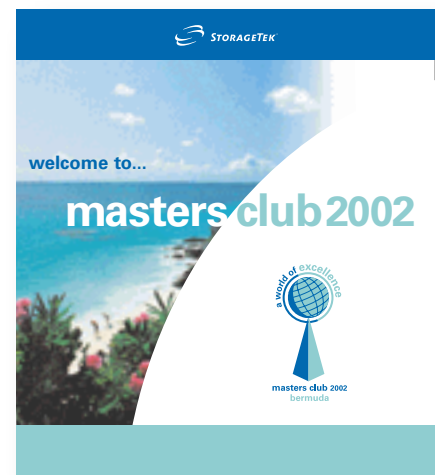
Posters and signs