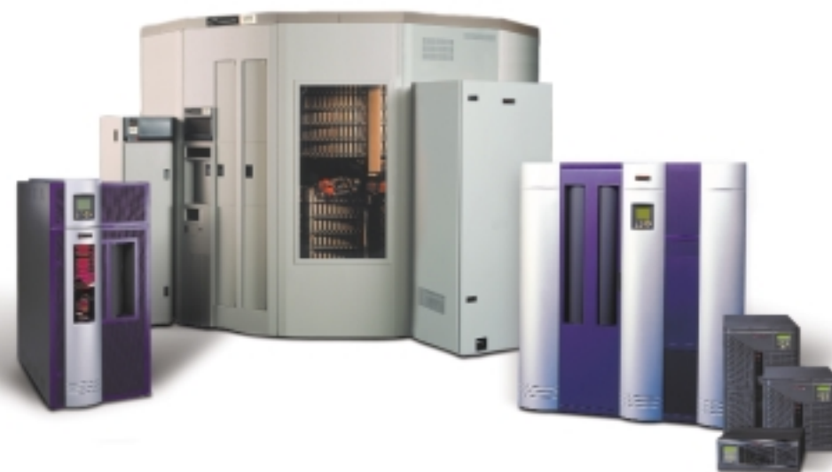
With StorageTek L-Series tape libraries, from the entry-level L20 tape library up to the enterprise-class L5500 tape library, your information storage infrastructure can grow without limits.

And since it is easy to mix and match drives and drive interfaces, such as SCSI and native Fibre, you can optimize your automated tape library across your varied applications.